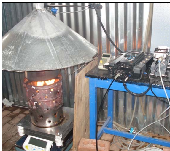
Figure 3: Imbaula test assembly