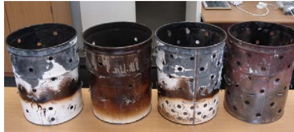
Figure 2: Image of imbaula stoves (Imb01w – Imb04w)

The first three designs (Imb01w, Imb02w and Imb03w) had a uniform hole diameter of 18 mm, while Imb04w had hole diameters of 20 mm below the grate and 18 mm above the grate. Primary air was supplied into the brazier through air holes below the fire grate whereas secondary air was introduced through air holes above the grate. For the first three designs, the fire grate was set at one-third of the device height in keeping with common practice for wood burners in the study area.